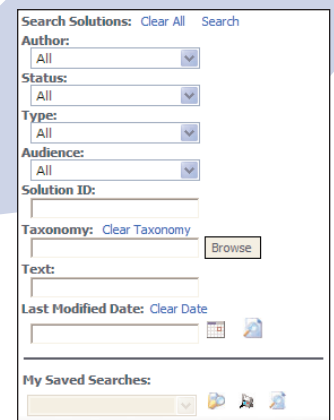
Defining Search Filters

The Bulk Editor enables administrators and approvers to search for and select solutions, change the solutions' status, audience or author, and update these values in bulk.